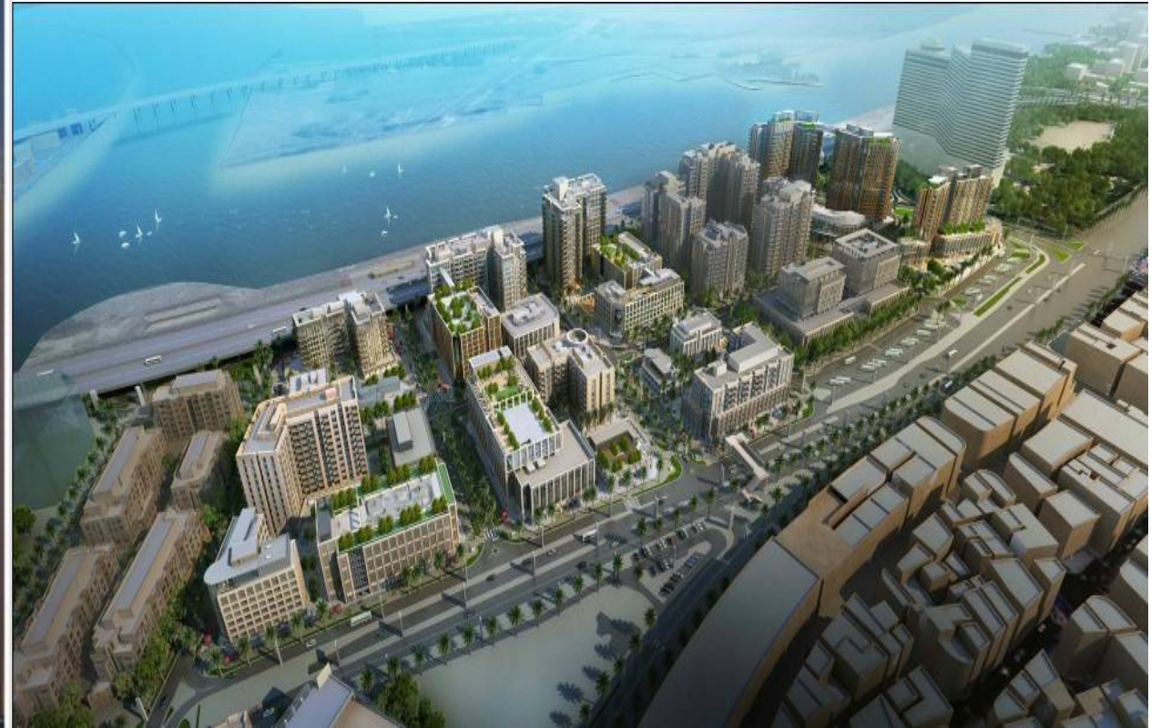
Deira Water Front (Quantity Audit)