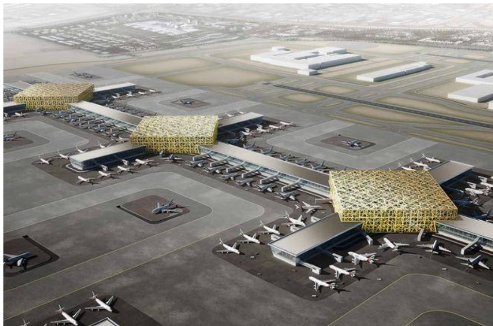
Maktoum Airport Expansion