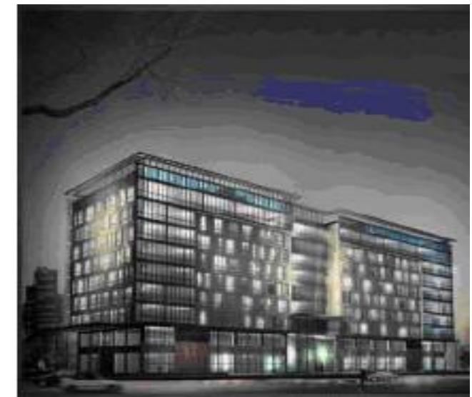
BUSINESS PARK: 2B + G + 8 TYP.