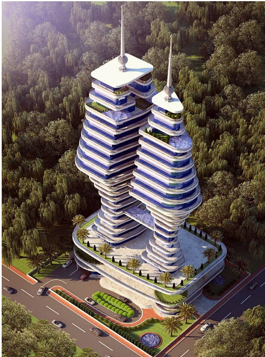
Incredible Design for a Mixed Use Project at Lagos, Nigeria