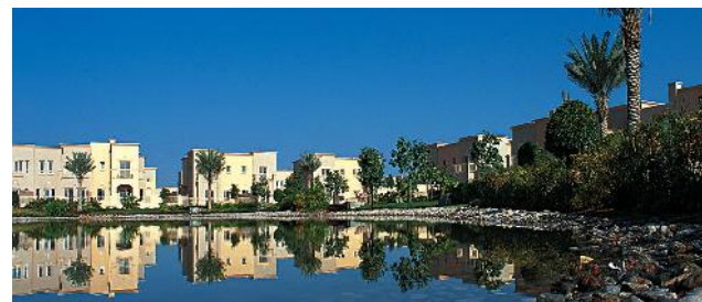
The Lakes Community: Maeen Neighborhood Development 330 Villas—Zulal Neighborhood Development