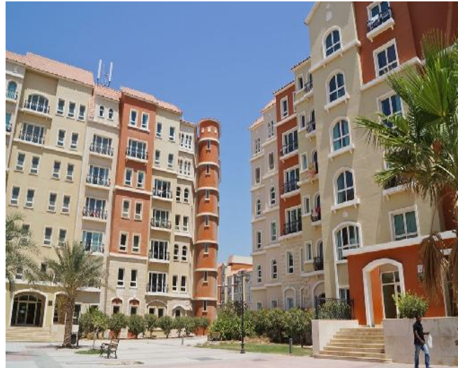
Discovery Gardens—Dubai, UAE