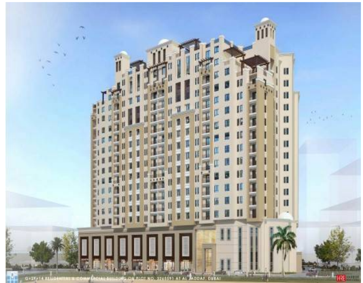
Residential Building at Cultural Village, Jaddaf, Dubai—UAE