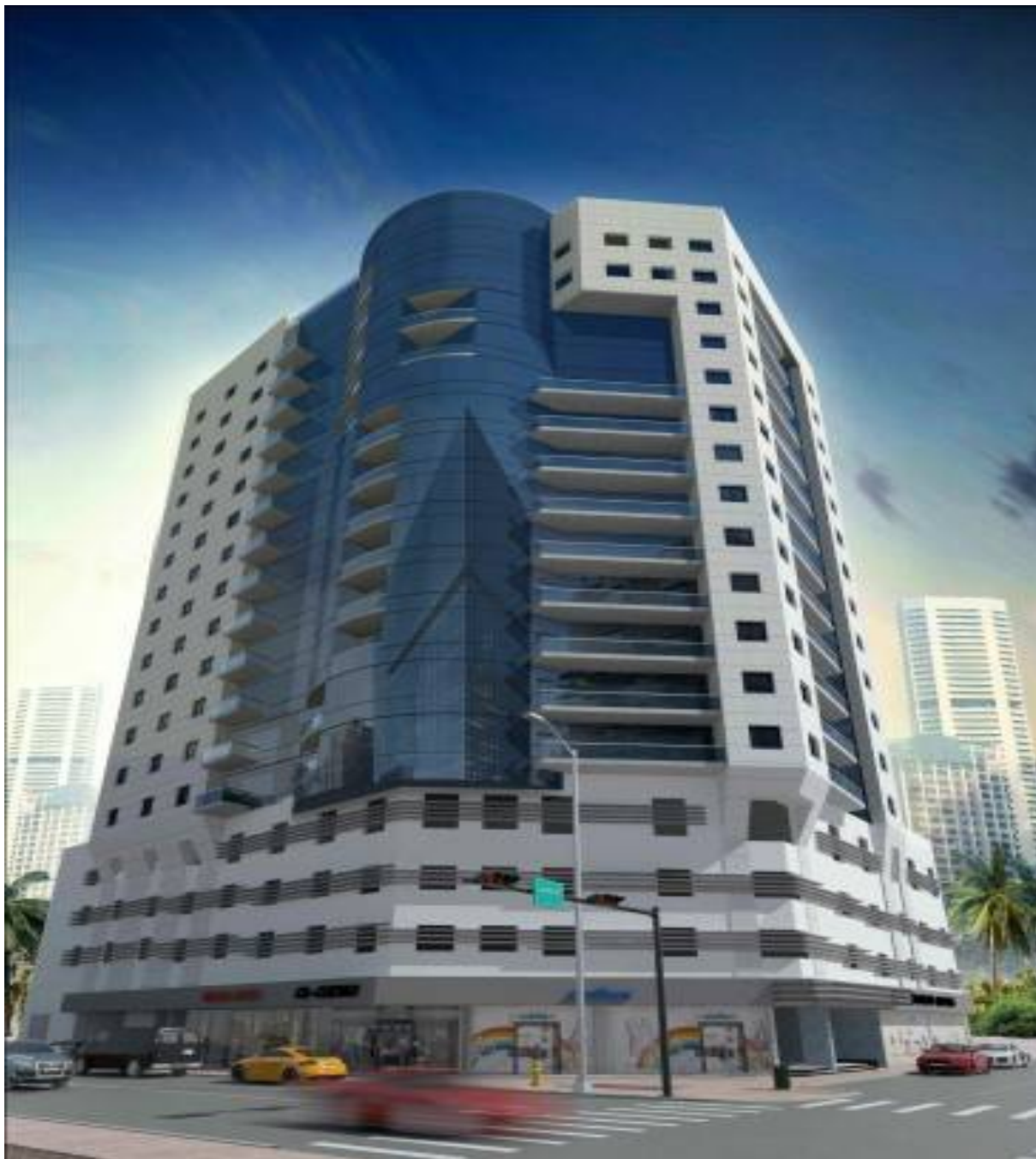
Residential Building at Mamzar, Dubai—UAE