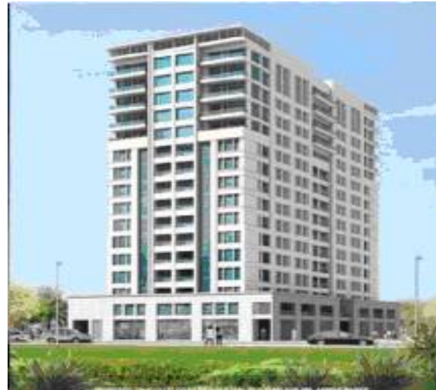
Proposed 2B+G+15 Residential Building – Al Nahda First, Dubai