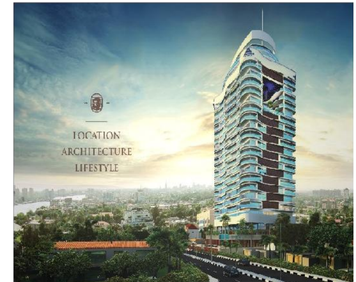
Eye of Bourdillion—Lorenzo by Sujimoto, Nigeria Feasibility Support