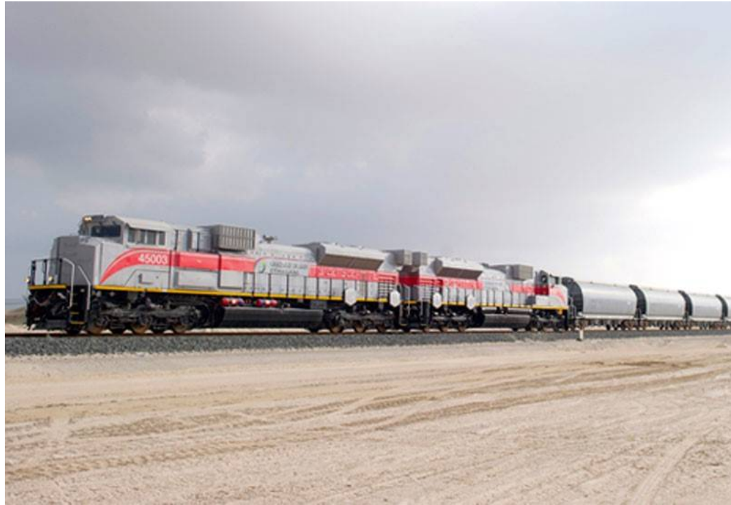
Etihad Railways Expansion