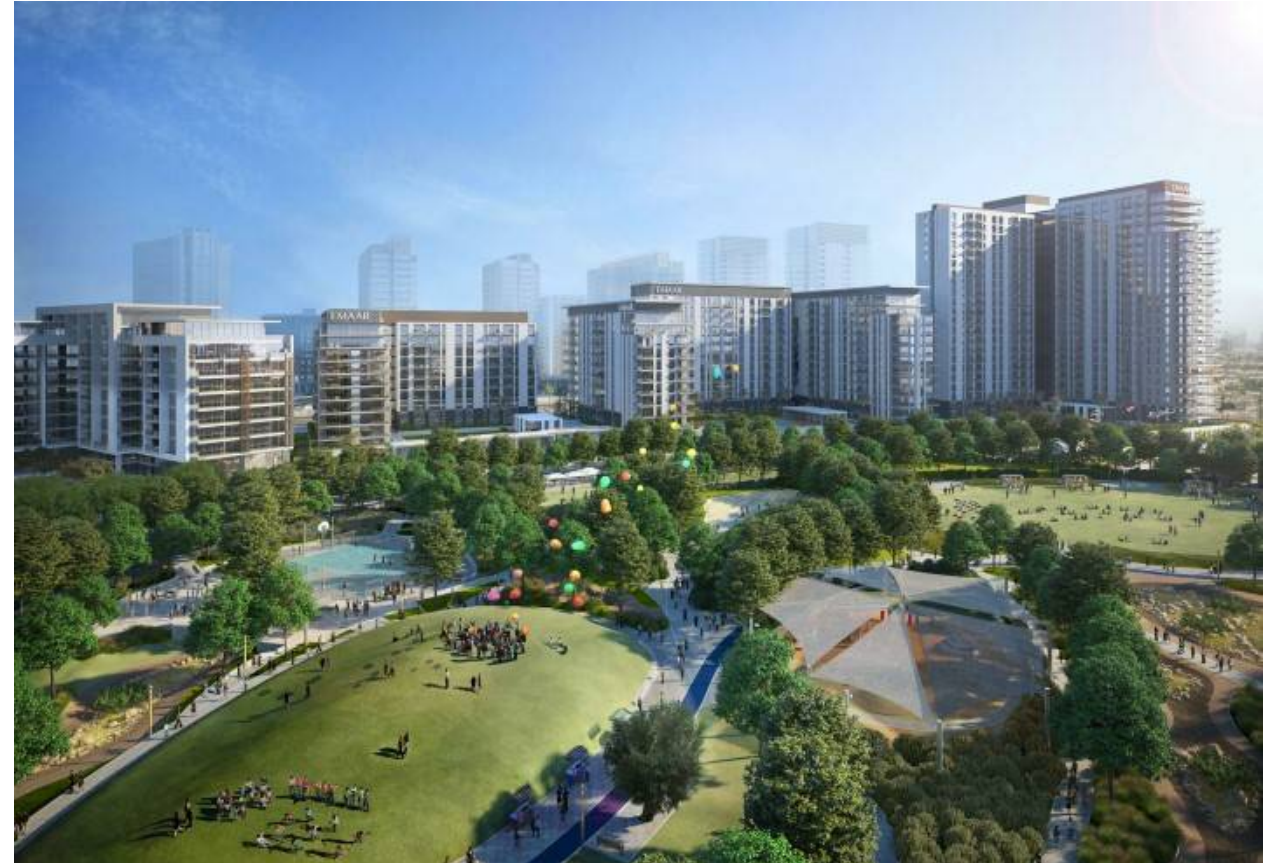
Park Ridge (Quantity Audit, Tendering)