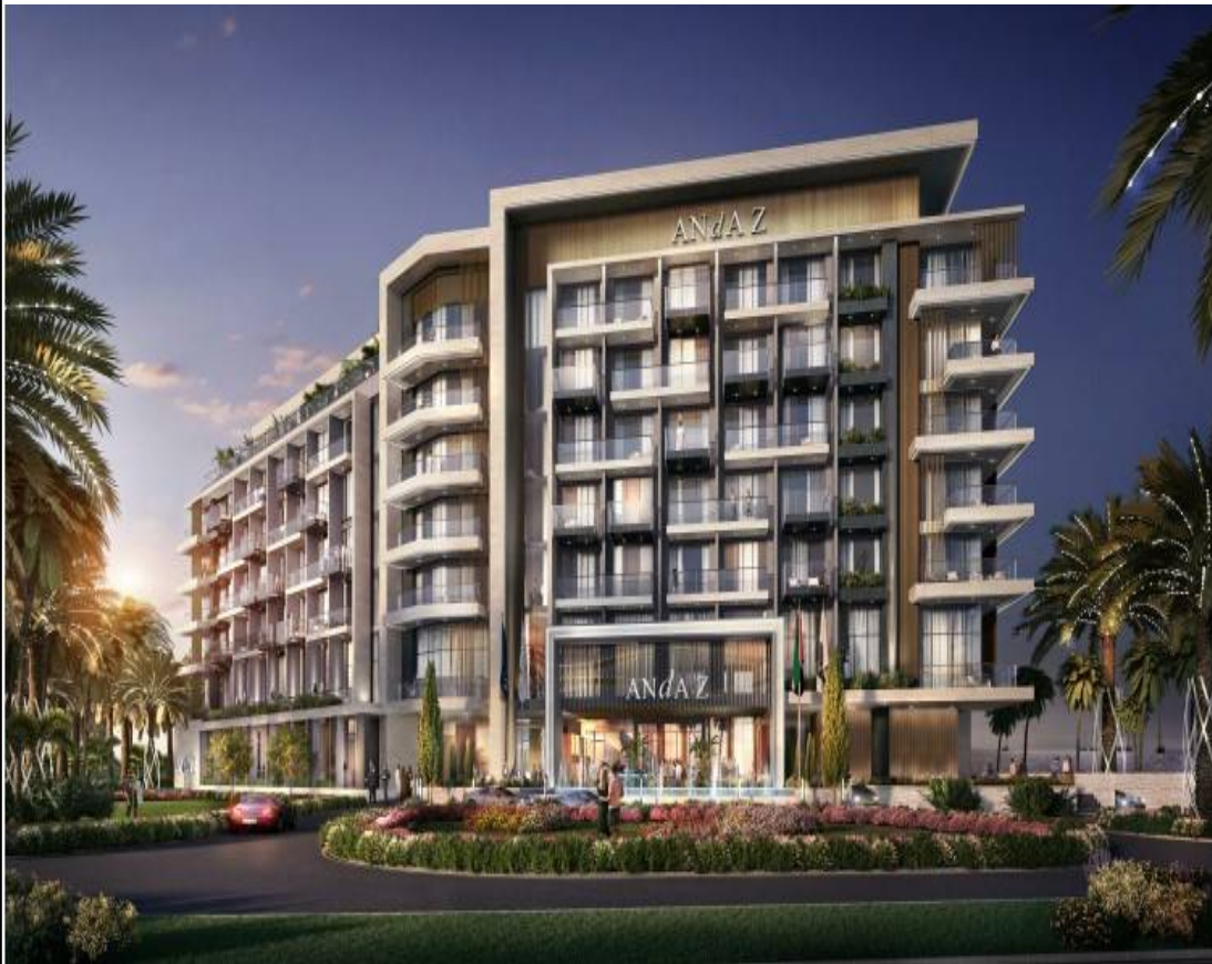
Andaz Hotel, Dubai, UAE