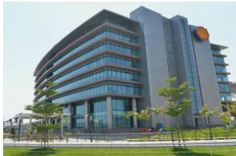
Shell IT Center, Bangalore Shell Market India (p) Ltd, INDIA