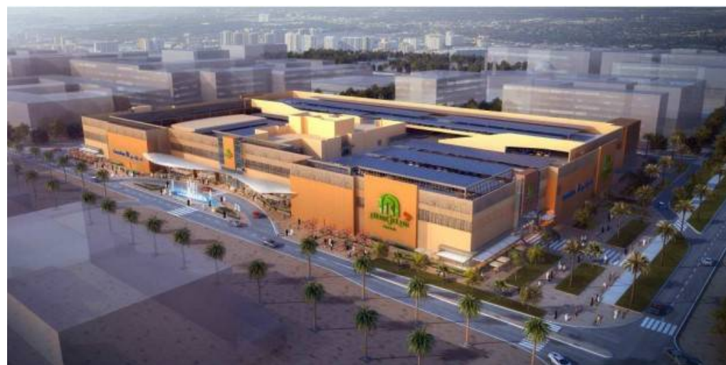
My City Center, Masdar city, Abu Dhabi: Quantity Audit