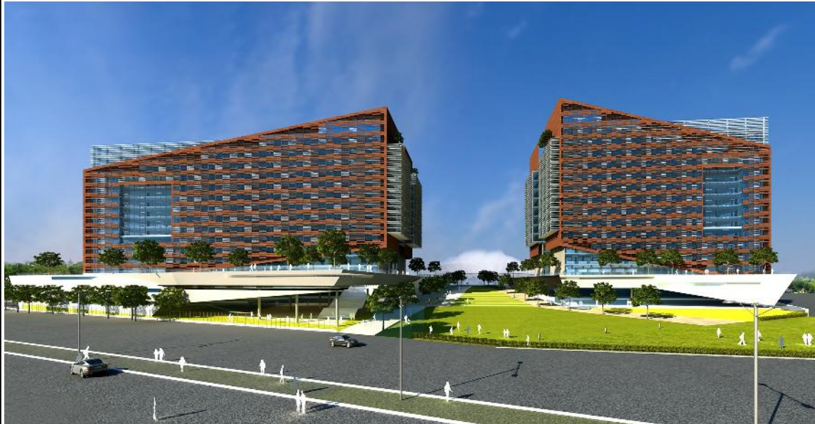
IT park / Office / Retail Buildings At Bengaluru, INDIA