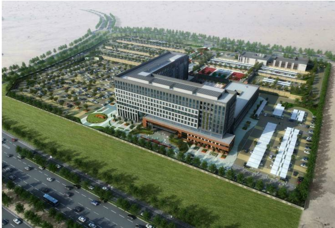
Fly Dubai Head Quarters: Quantity Audit & Support