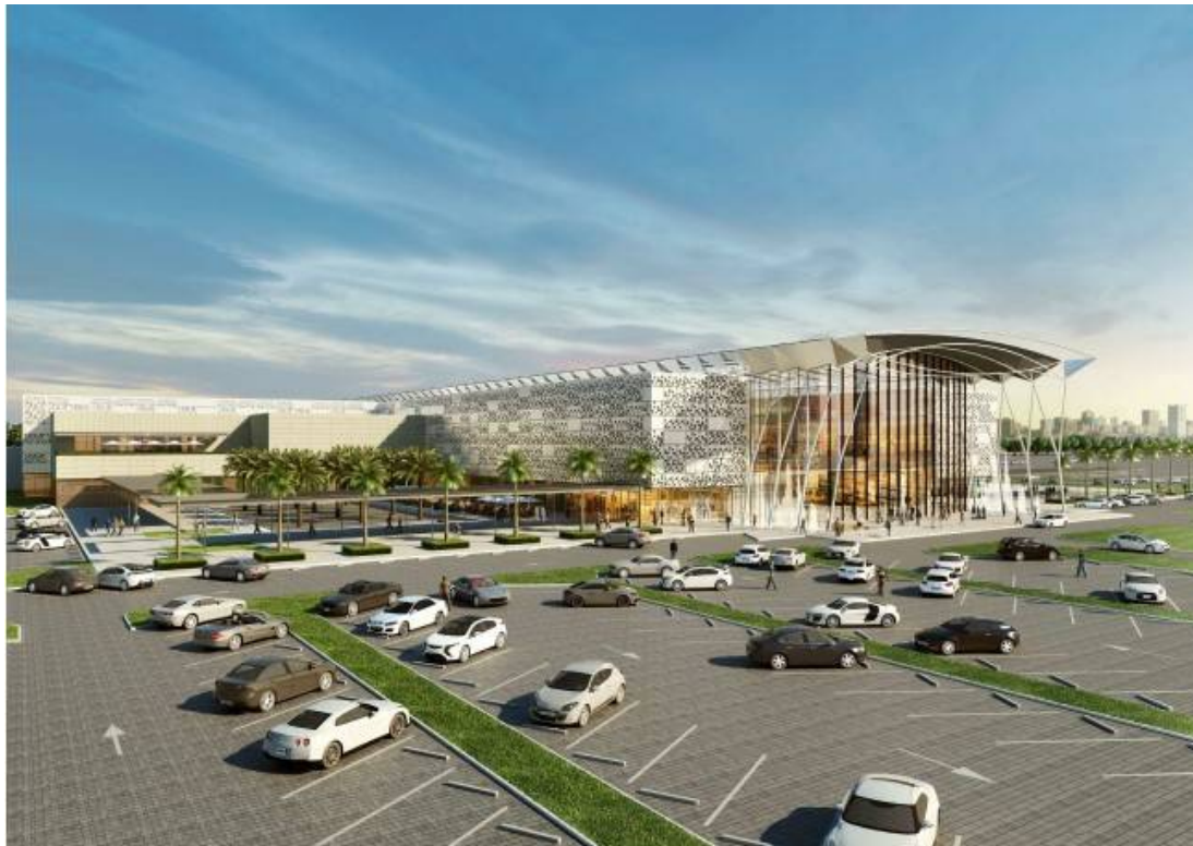
Mirkaz Mall Ajman—Quantity Audit & Support