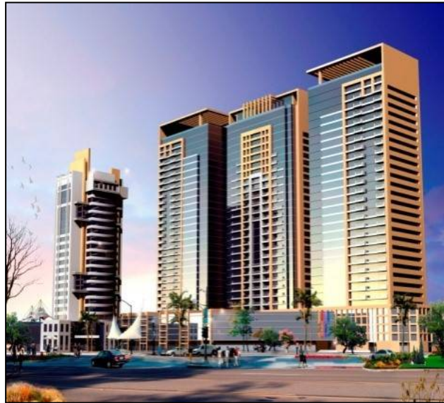
Ajman One – Novotel Hotel MEP Design & Support