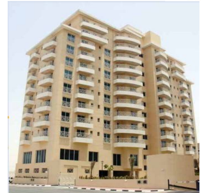
2B+G+12 Residential Building, Al Ghusais, Dubai—UAE