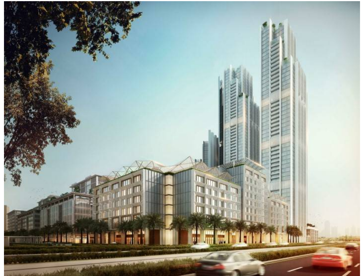
One Central: Phase 1A7, H2 Hotel (Quantity Audit)