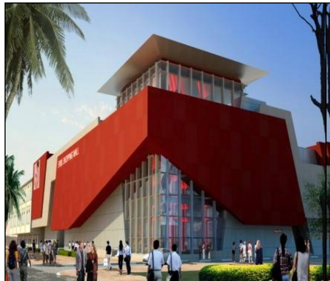
Erbil Mall, IRAQ—MEP design & Support