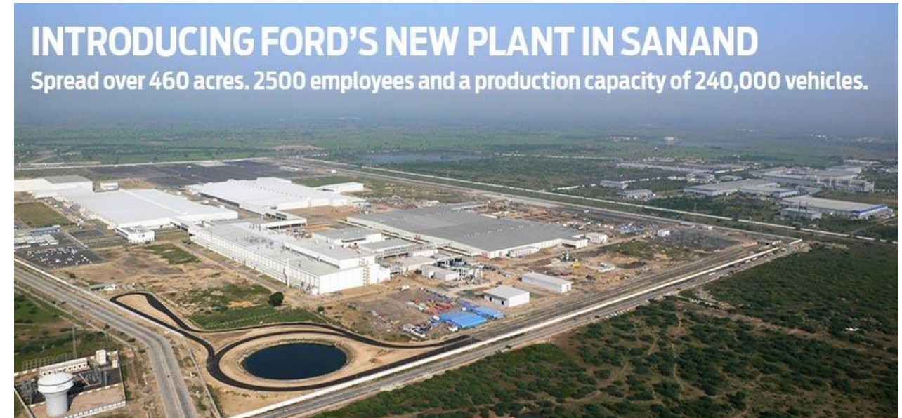
Package 9, Ford India Plant, Sanand, Ahmedabad, INDIA