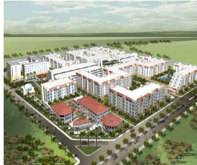
Ritaj Residences—DIP, DUBAI