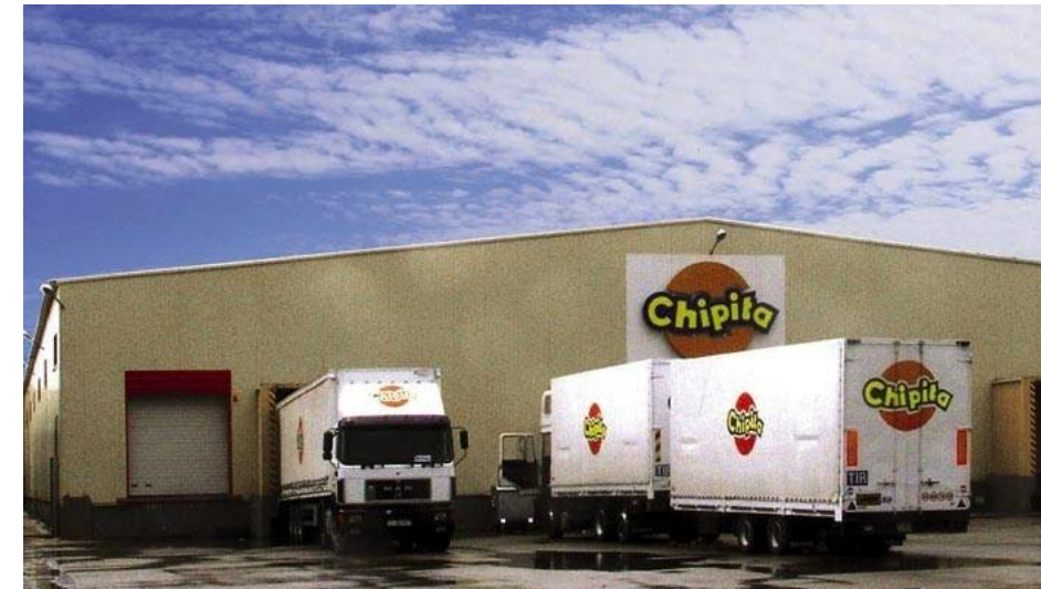
Chipita Food production Plant at Sanand, Gujarat, INDIA