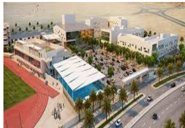
German School in Dubai, UAE