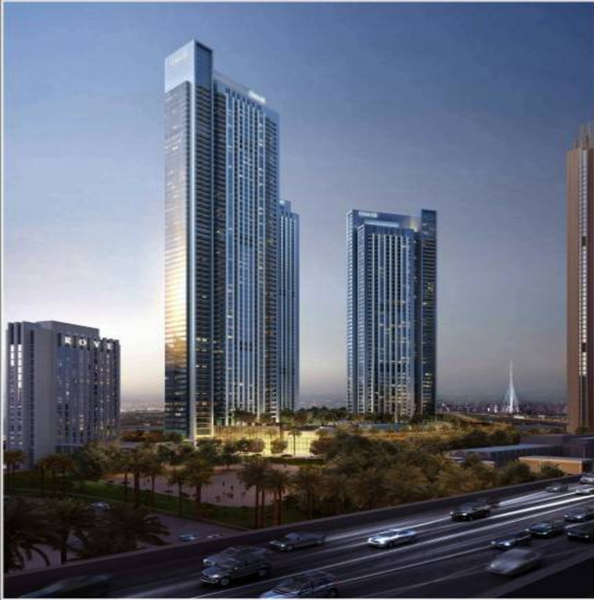
Downtown Views II, Zabeel Second (Quantity Audit)