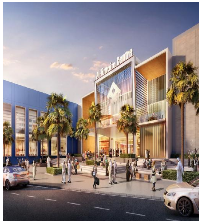
Dubai—Box: Retail Part Quantity Audit