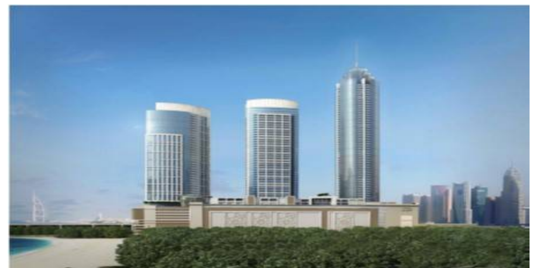
The Palm Jumeirah Gateway Towers and Podium—Quantity Audit